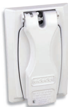
White — DCCU-WH