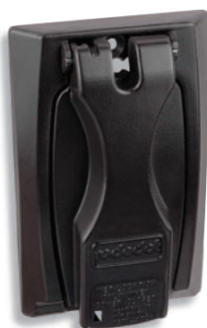
Bronze — DCCU-BR