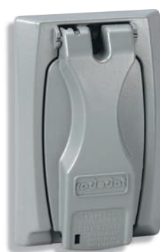
Silver — CCU