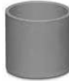
Socket type for joining non-metallic conduit.

All socket fittings should be attached using Carlton® solvent cement.